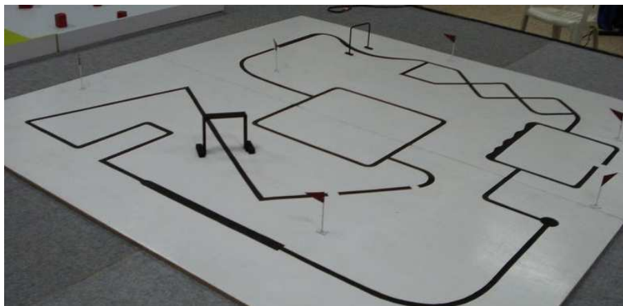
Figure 1. The Line Following robot arena

Some negative experiences with the use of robotics are associated with the incorrect use of this approach. In this case of the logic reasoning development, there are reported cases where educators suggest the problem and indicate the steps, features and functions that should be used to resolve such a problem. According to the basic idea of the educational robotics, this kind of approach is not appropriate once the problem must challenge students so that they should think by themselves about solutions and project decisions. For example, a classic robotic problem is to design and build a Line Following Robot , which is able to complete a circuit defined by a black line on a white background (Figure 1). The arena can have lots of turns, including sharp ones, together with breaks and multipaths, so that the robot has to make decisions and navigate along the entire path.